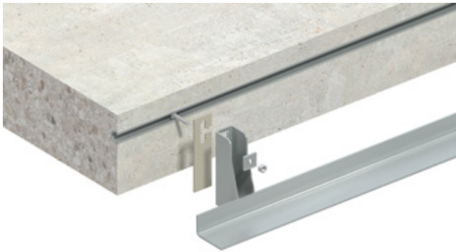
Ancon MDC Masonry Support Systems

To promote good installation practice, many cavity barrier manufacturers offer installation training and site support - contact your chosen manufacturer for further information.