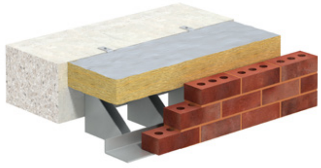
Cavity barrier with 50% penetration by Ancon MDC Masonry Support System