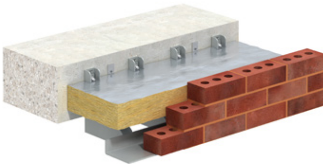
Cavity barrier fully penetrated by Ancon MDC Masonry Support System